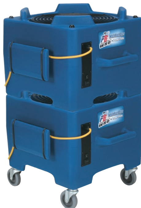
Stackable design for easier storage