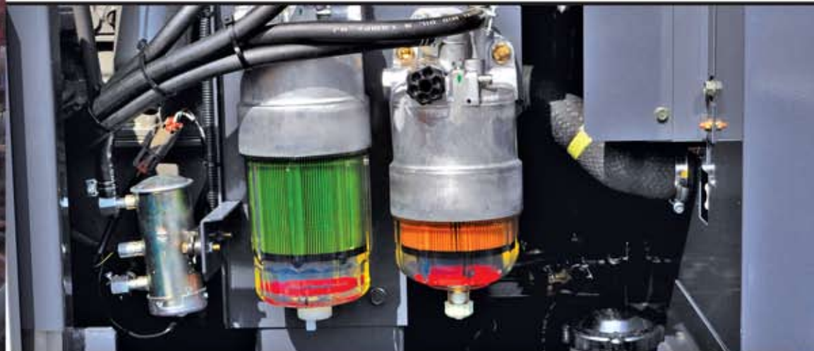
EFPA pump and dual acrylic "cartridge style" fuel filters.